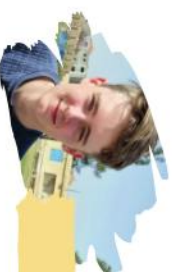
VASSEL FROM NETHERLANDS

What struck me the most is to see the joy of the children and everyone. And you can see that this place is being built with love.